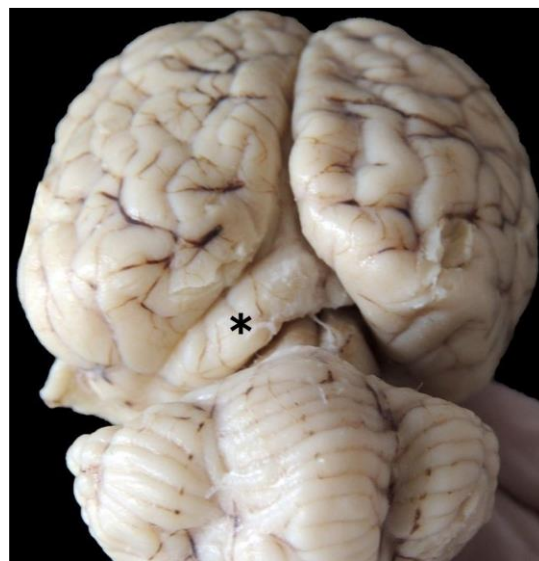
Figure 2. Brain, sheep