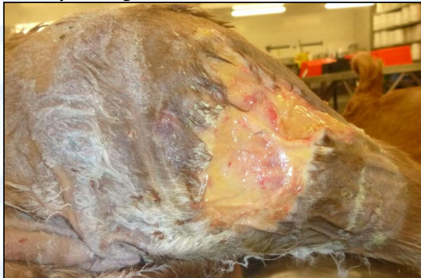
Figure 1: Caudal forelimb