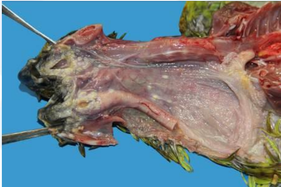
Figure 1. Gross findings

Follow-up questions: Microscopic description, Morphologic diagnosis, and three possible etiologies.